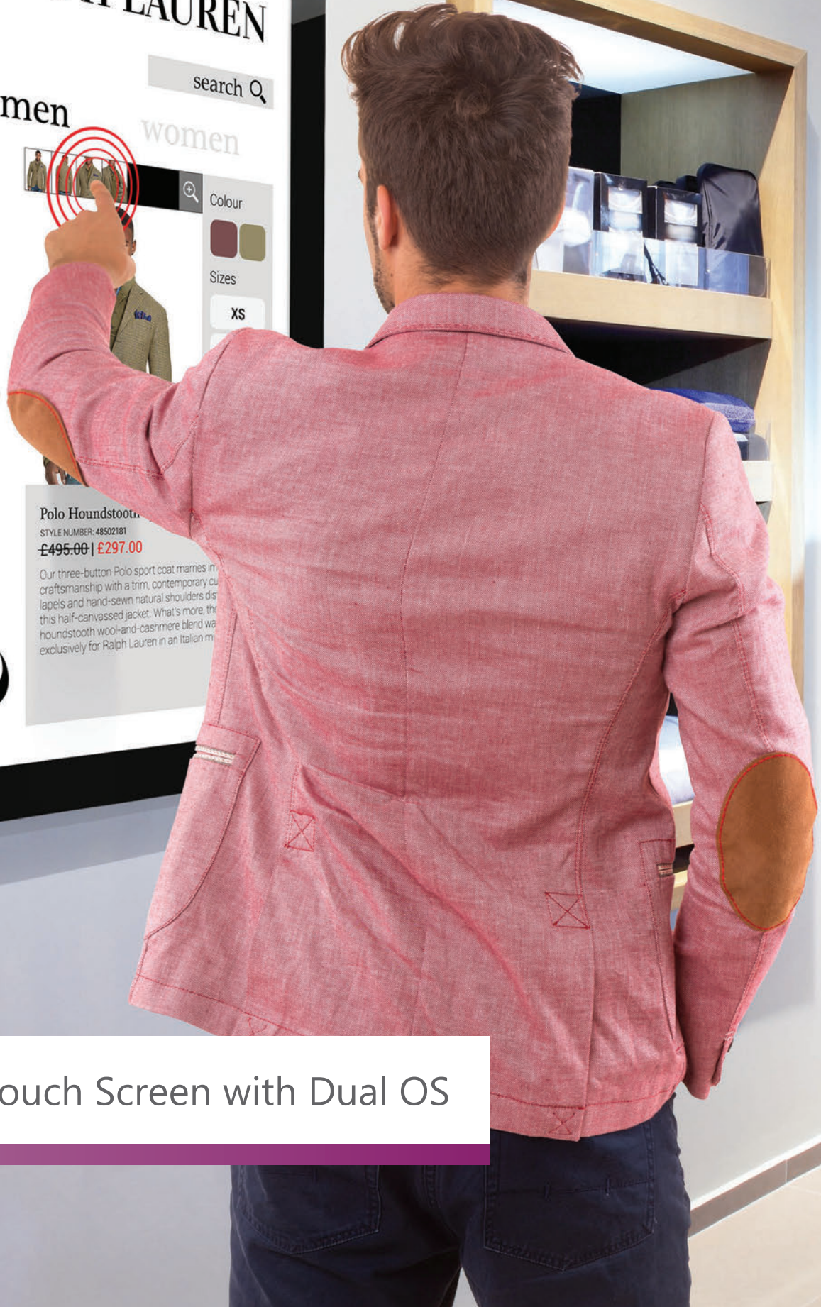
22" PCAP Touch Screen with Dual OS