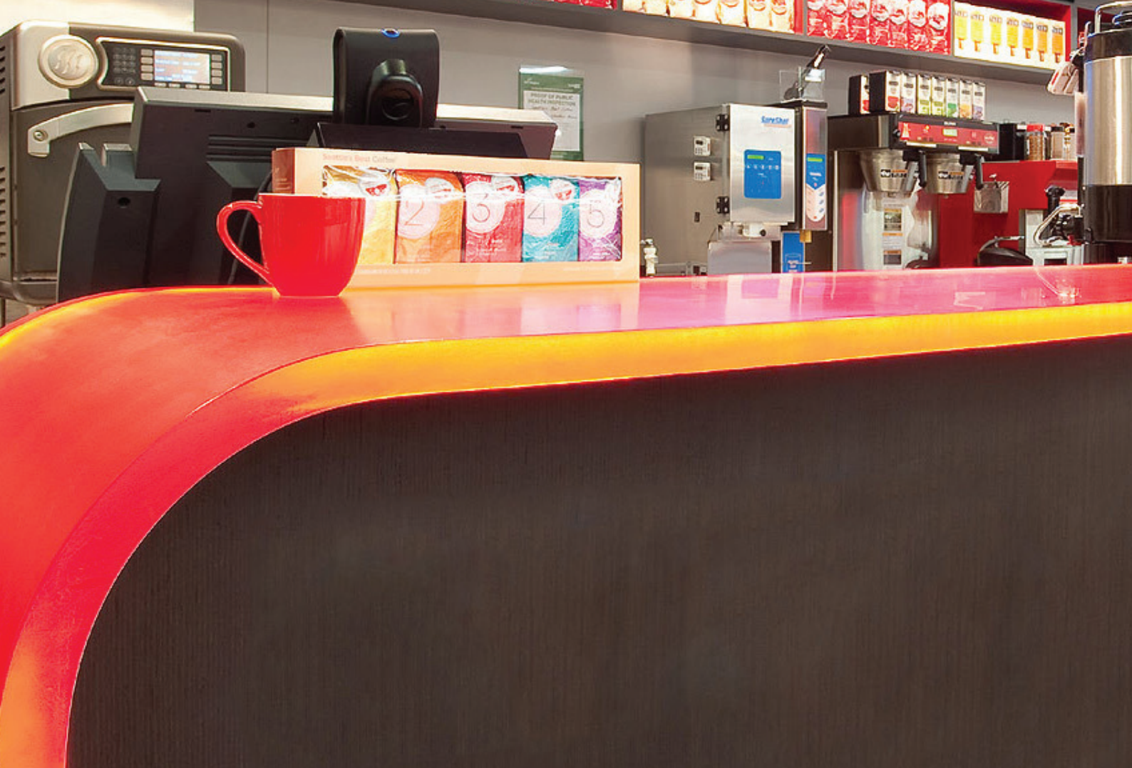
32" Network Digital Menu Board