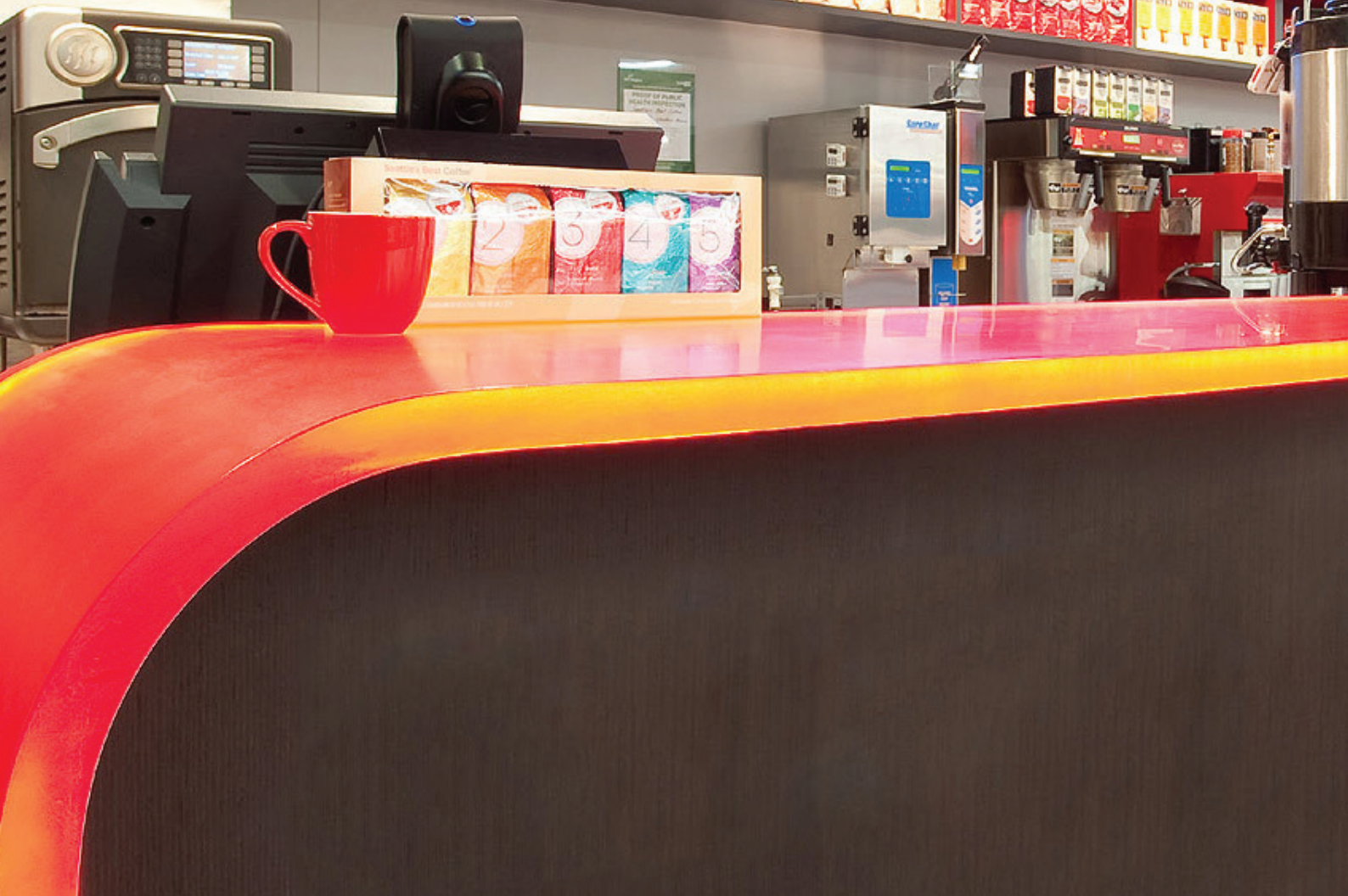
43" Network Digital Menu Board